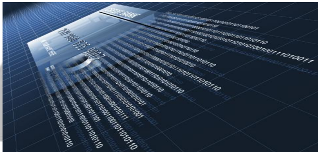
Compromised Card Data